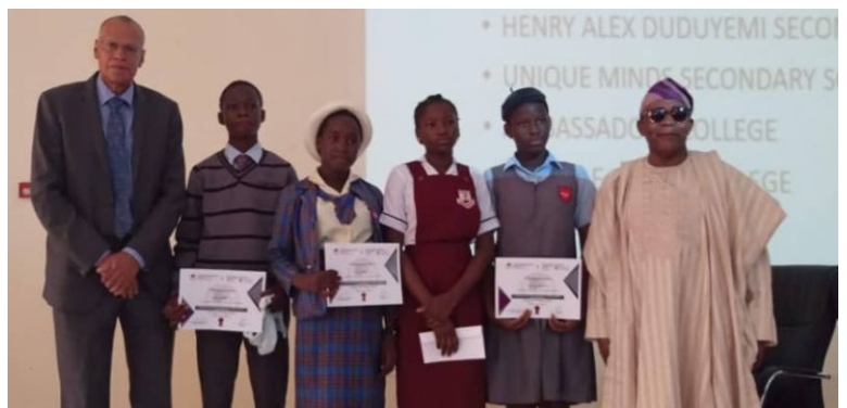
Winners of the WMHD essay competition among Secondary school students in Osun state with The founder of CAREMI Foundation and a member of the BOT

The Foundation continued its Mental Health Education and Sensitization programme for Secondary schools in 2019. Schools visited include OAU International school, Ambassadors College, God's Image Secondary school and Unique Secondary School in Ife and Ilesa Grammar School in Ilesa. We continue to raise awareness concerning the common mental health problems in children and adolescents and establish linkages to facilitate referrals and follow-up where this is indicated.